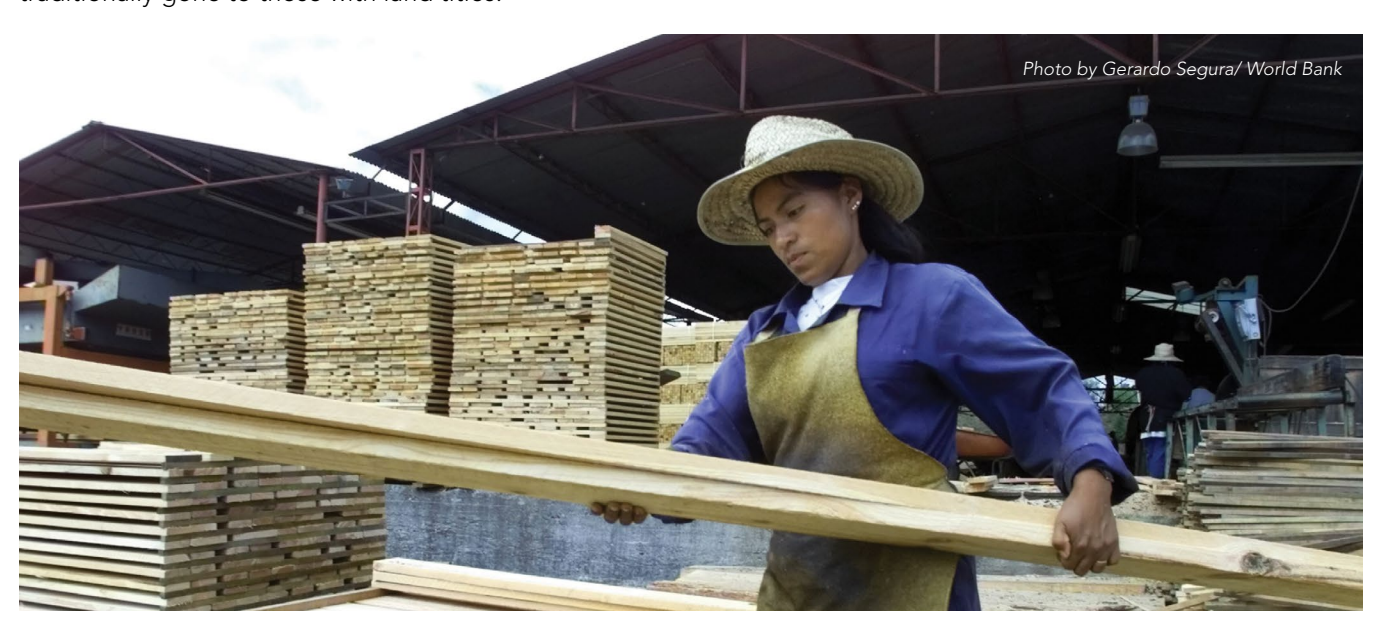
5 Funded by the Climate Investment Funds (CIF) and Forest Carbon Partnership Facility (FCPF)

Under a World Bank Loan linked with a dedicated grant mechanism (DGM) aimed at indigenous and local communities, women-targeted finance windows have been established and are expected to enable women to access finance for productive natural resource management