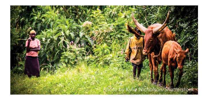
Uganda - Gender-REDD+ Roadmap. This was developed by the REDD+ Gender Task Force, supported by FCPF, together with representatives Ministry of Gender, Labor and Social Development; gender focal points of development partners; and IUCN's Global Gender Office. It includes the following actions: