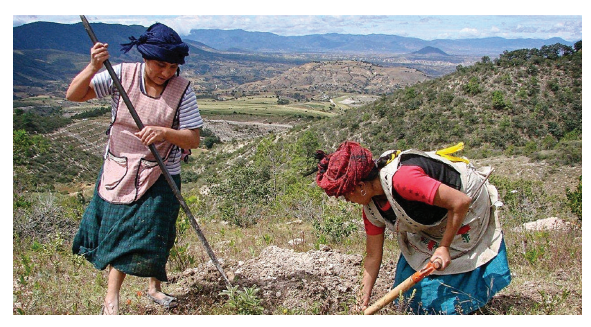
Women agroforesters, Mexico

The team leverages insights from behavioral science to design solutions that simplify procedures, increase women's aspirations through role models and provide commitment devices such as SMS reminders and hotlines to support women through the application process. These innovations, which are being field-tested, will be replicated at landscape level. This 'action research' will contribute to the much-needed evidence of the benefits, costs and impacts of gender-responsive approaches in forest landscape investments. It will also test and demonstrate innovative and relatively low-cost solutions and actions that similar programs in other countries could adopt.