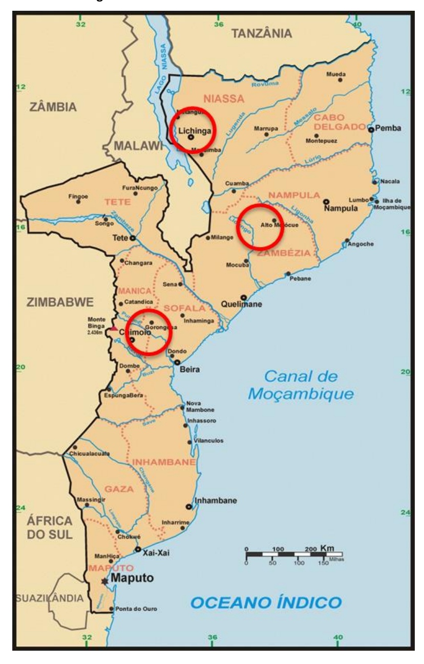
Figure 1.1. Location of Interviews Conducted

6. The interviews with companies were conducted through standard written questionnaires, while representatives from the provincial governments and from 20 communities were interviewed in the field. The questionnaire can be found in Annex 1. During the fieldwork, the questionnaires were conducted not only in large forests investments, but also in small- or medium-scale projects with plantation developments in Niassa, Zambézia, and Manica Provinces. The companies interviewed were Portucel, Moflor, Florestas do Niassa (FdN), and Green Resources (GR) (Figure 1.1).